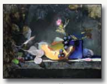
Jeff Legg, OPAM Cobalt & Cantaloupe DJFL2 • -4 hours • $95*