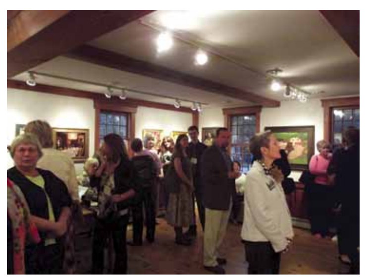
The opening reception was well attended on September 17