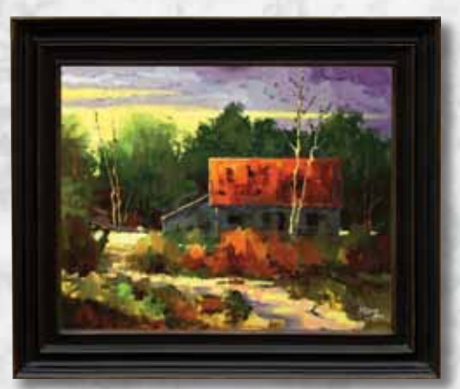
Neil Patterson, OPAM, RMPAP 'Red Roof' Frame Model: C-2