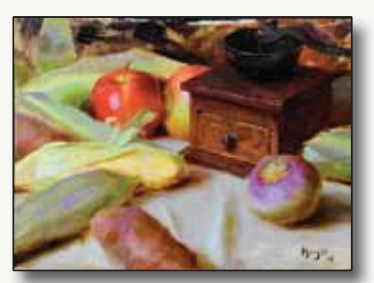
Daniel Keys Antique Coffee Grinder DDK2 • 3h 30m • $85*