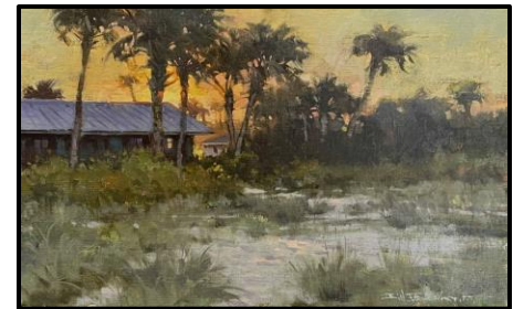
Sand in your Toes, 14" x18", OPA Salon Landscape Award of Excellence