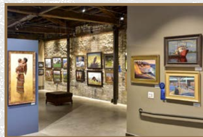
Steamboat Art Museum