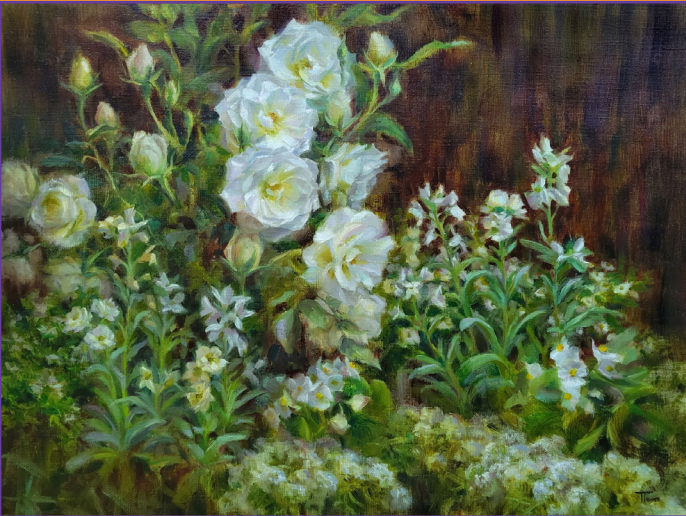
Iceberg Roses in the Garden by Tamsen Taves - Fifth Place 2022

OPA's goal is to raise awareness of representational art and provide an opportunity for students to learn more about this beautiful art form.