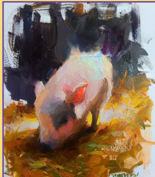
Little Piggy by Ava (Xiaosy) Chen - Second Place 2022