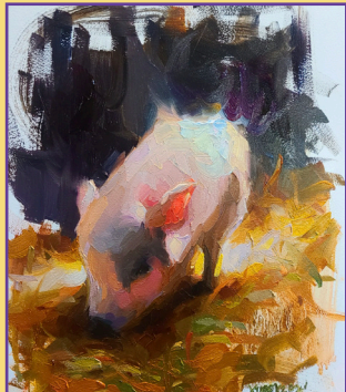
Little Piggy by Ava (Xiaosy) Chen - Second Place 2022