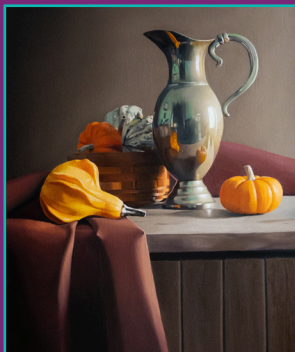
Autumn Harvest by Emily Hutton Honorable Mention 2023