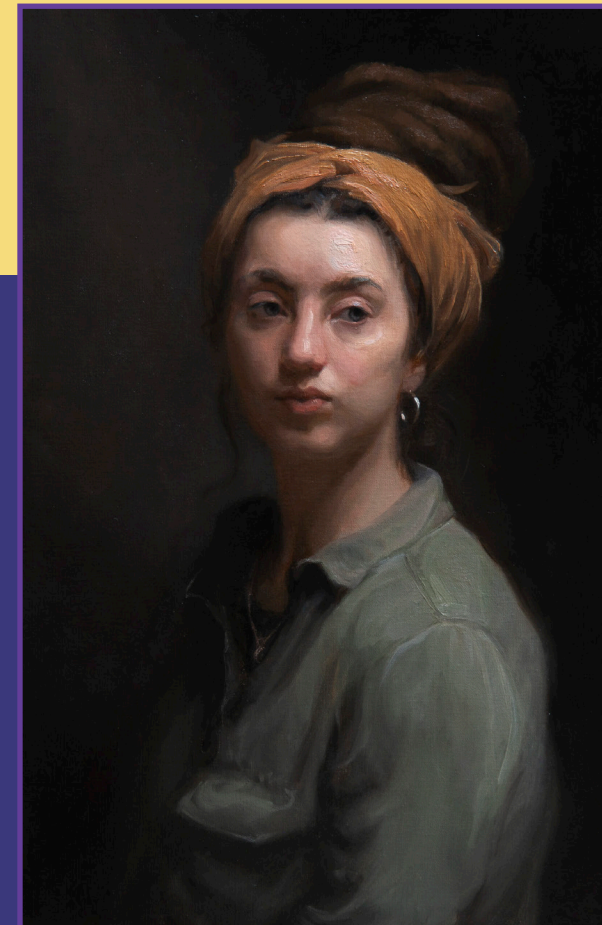
Bohemian Beauty by Samuel Hoskins - First Place 2023

WHAT Paintings must be created in oils in the representational style. This includes a broad spectrum of styles ranging from realistic to impressionist or your own style, as long as it is representational. Both plein air and/or studio work are acceptable. All submissions will be displayed online with the artist's name, painting title & size, school name and age on OPA's website. All entries must depict family-friendly subject matter (any portrayals of graphic nudity, violence, or other non-family-friendly subject matter will not be accepted).