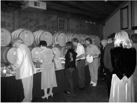
OPA members and guests dine in style at the Silver Rose Winery in Calistoga.