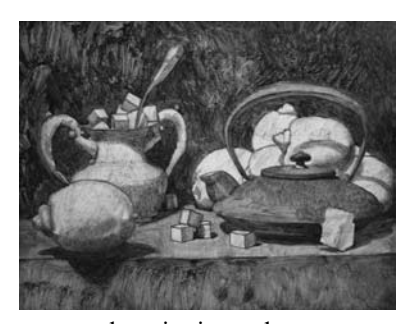
underpaint in earth tones