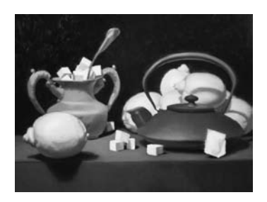
establish color values