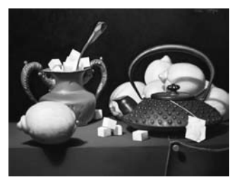
the final painting