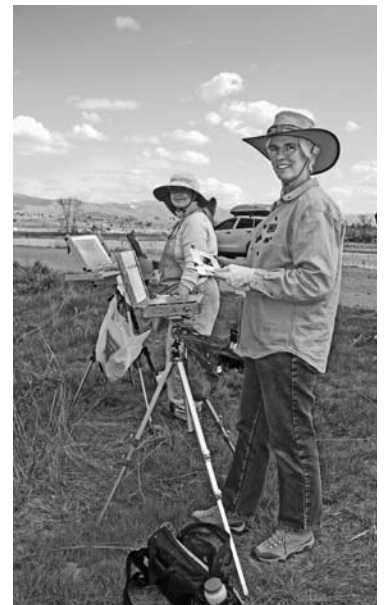
Plein aire painting on Sunday at the Lee Metcalf Nature Center