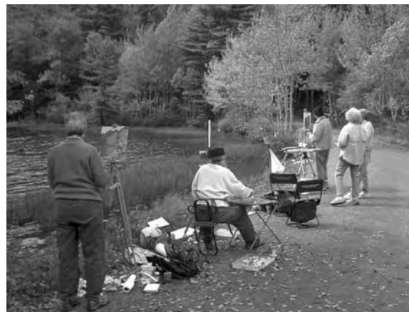
Painting at Southwest Harbor on Mount Desert Island

Southwest Harbor is on Mount Desert Island, which is home to Acadia National Park. In early October, the fall foliage hits its peak, and we were blessed with particularly spectacular foliage around some of the interior lakes and ponds. These colorful vistas were well-suited to Lois' approach. Basically, two concepts rule. First, if you stare long enough at a field of color, you'll begin to see a bit of that color's complement. Second, shadow color tends to show the complement of the light source, mixed in with the local color of the shadow area. To put these concepts into practice, it doesn't matter which order the color goes down in. You can either lay in the local color first, followed by the complement; or you can reverse the order. It's very important, though, that the values be exactly the same. The effect can be really stunning when you're working with complements like pink and green or orange and blue!