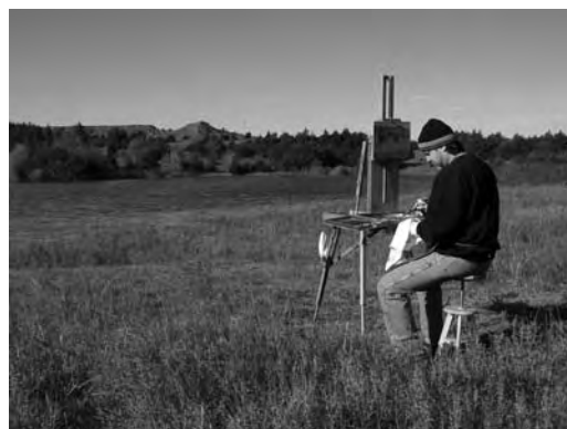
Gyp Hills, west of Medicine Lodge, KS was the site of the October 25 Great Paint Out in Kansas. After a day of painting, the artists met at the Caroline Norton Studio to view the results of the day's efforts

Calling all volunteers! This year will mark the Fifth Annual Great Paint Out — a wonderful opportunity to meet oil painters in your area. Don't wait for someone else to do it! If you are enthusiastic and good at organizing, then we are looking for you. To find out more about what is involved, please e-mail to: mail@oilpaintersofamerica.com .