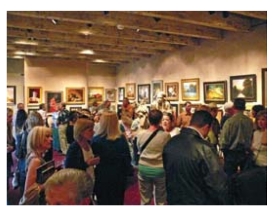
The opening of the exhibition was well attended by both artists and collectors