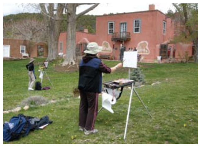
One of the plein air painting locations was the beautiful and tranquil Randall Davey Audubon Center

OPA is now offering a critique service thanks to the many wonderful Signature and Master Signature members who have volunteered to help us with this endeavor. If you would like to have your work critiqued, please mail two identical discs containing 3-10 paintings of your most current work, a brief one-page bio along with a $25 check payable to OPA. The service is also be available to non-OPA members at a cost of $50. One disc will be sent to one of our Signature or Master Signature members for their review and the other will be kept on file. The volunteer critiquer will review your work and provide you with constructive criticism and feedback. As you know, our volunteer critiquers are very busy, so please allow four to six weeks to receive feedback.