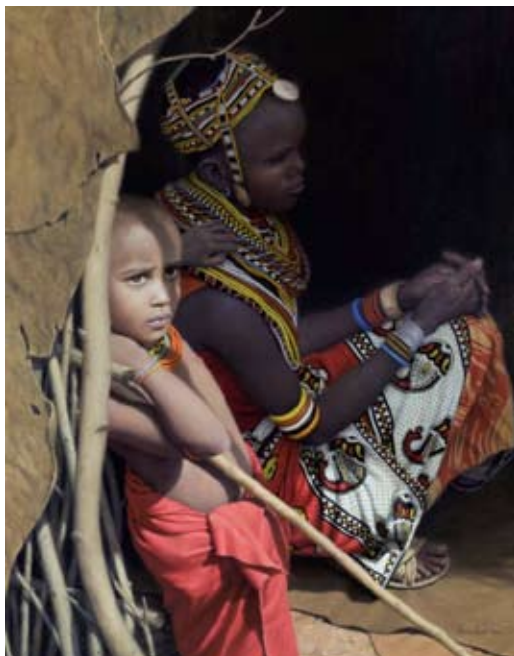
Gold Medal winner "By Hand" painted by Nancy Howe OPA

Located on a busy street, Corse Gallery sits in an affluent pocket of Jacksonville with scenic water views just down the road and