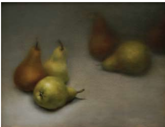
Rita Spalding's painting "Pears in Winterscape" won the Bronze Medal

Gold Medal – Master Signature Division: Zhiwei Tu OPAM for "Interested" - $3,500 funded by OPA