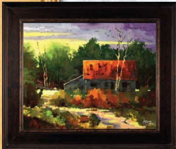
Neil Patterson, OPAM, RMPAP 'Red Roof' Frame Model: C-11