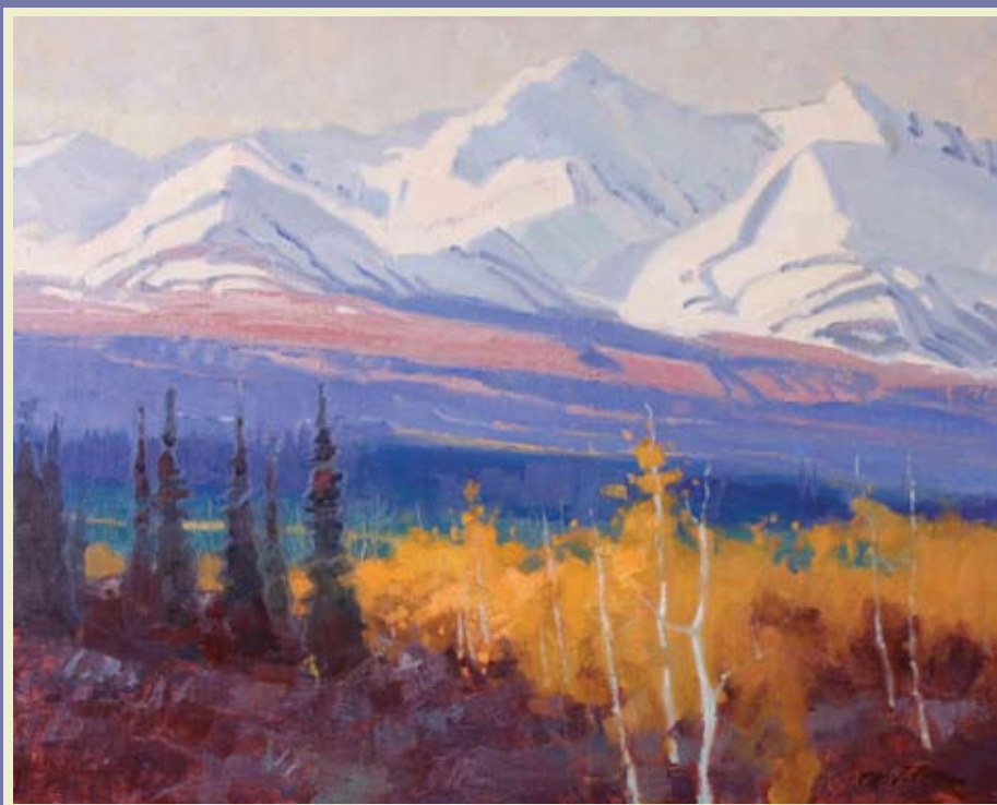
"Yukon Gold", Oil, 24" x 30"