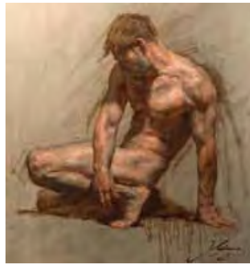
Crouching Figure by Rob Liberace