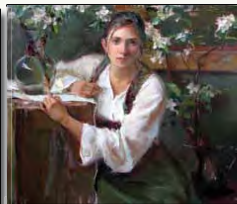
Dan Gerhartz Mother's Locket D-DG-1 • 6 hours • $175* Special Re-issued DVD

Sign up for our mailing list to receive special discounts on New Releases.