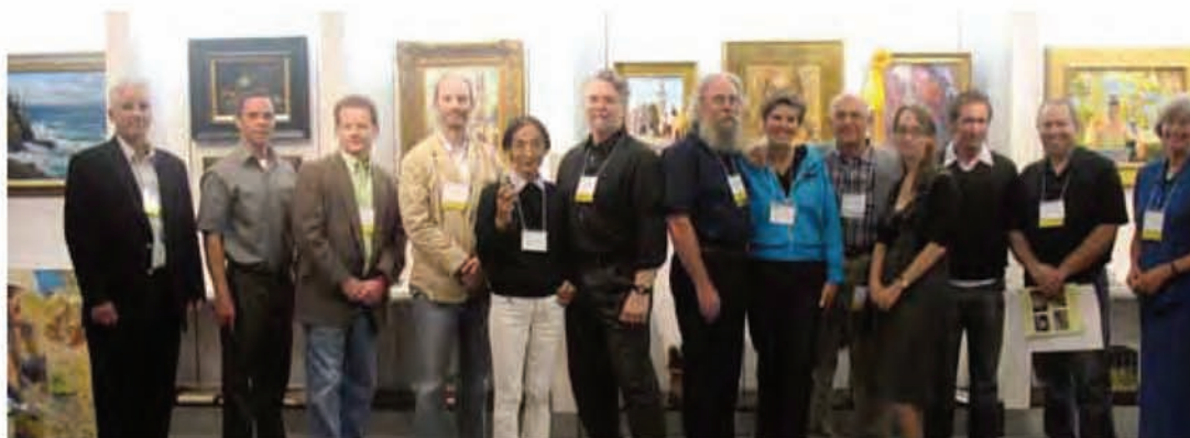
Artists and guests took time away from enjoying the exhibition for a group photo