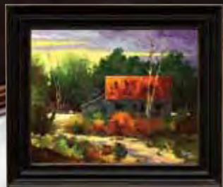
Neil Patterson, OPAM, RMPAP 'Red Roof' Frame Model: C-2