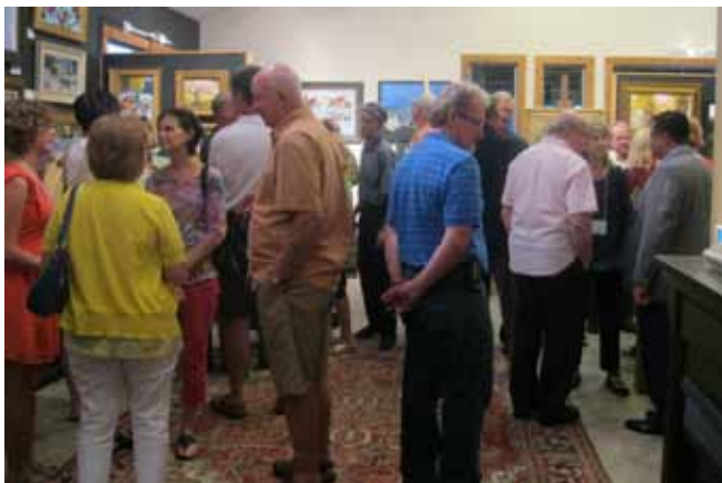
Artists, collectors and friends viewed the fantastic works at the SouthWind Gallery